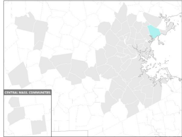
Combined Rate Increases 1992 through 2021