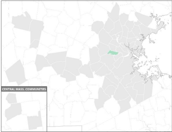
Combined Rate Increases 1993 through 2022