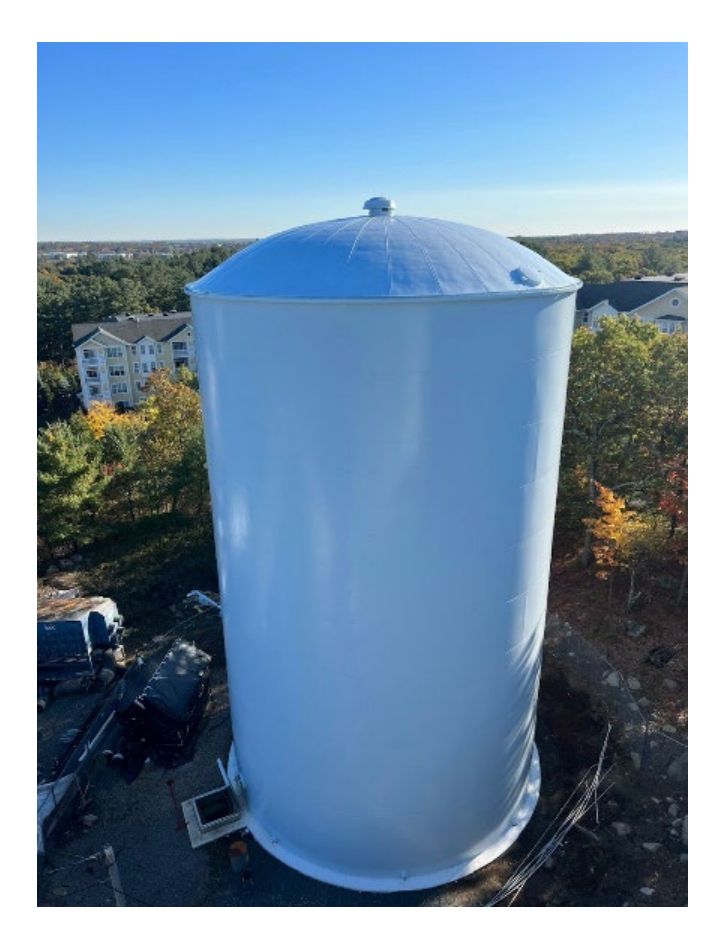
Water Storage Tank Rehabilitation