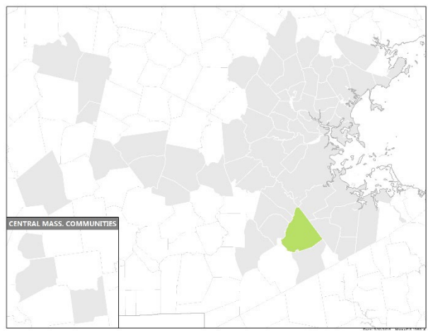
Combined Rate increases 2003 through 2023