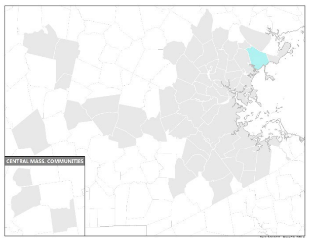
Combined Rate increases 2003 through 2023