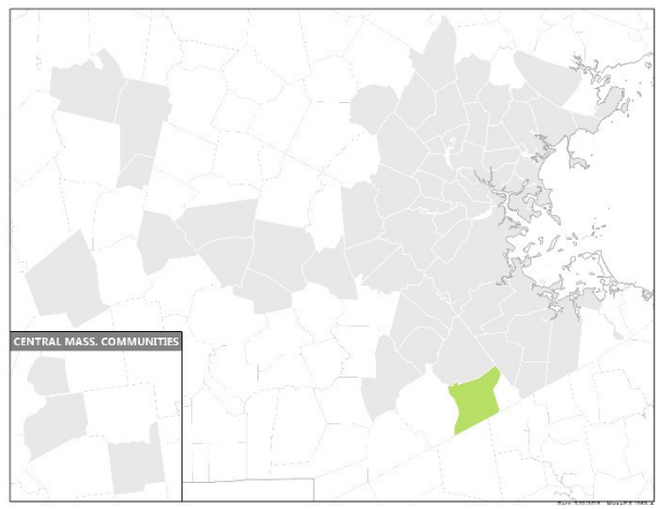
Combined Rate increases 2003 through 2023