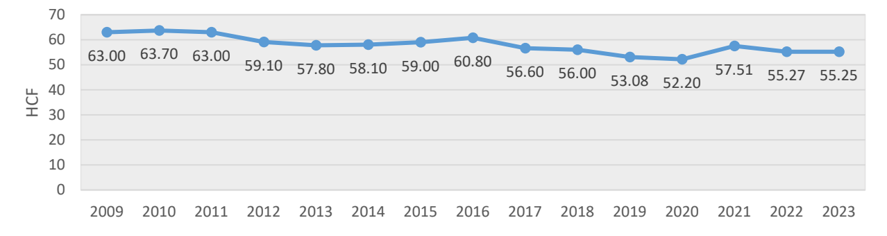
Average Household Water Use 2009 through 2023