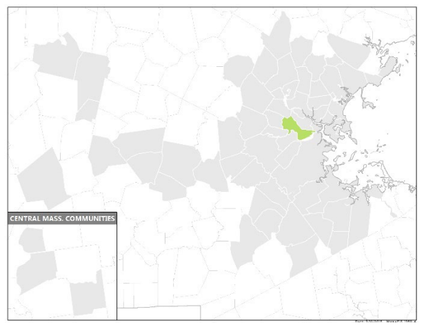
Combined Rate increases 2003 through 2023